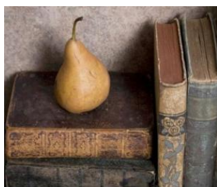
DE KATHOLIEK, PART 44...